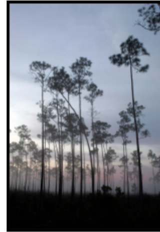
Figure 2. Pine Rocklands, some of which are located in Everglades National Park, restoration has been the objective of some Fish and Wildlife Programs.

Interior has already found itself in situations which illustrate the need for an Interior-wide scientific integrity policy. One example is a case that garnered media and congressional scrutiny when the then Deputy Assistant Secretary for Fish, Wildlife and Parks was found to have unduly influenced a critical habitat designation. The fallout resulted in having to republish the corrected designation, but even more damaging was the effect