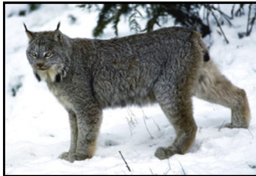
Figure 3. The Canada Lynx was listed as threatened under the Endangered Species Act in 2000.

In yet another example, the Office of Inspector General (OIG) conducted an investigation of scientific misconduct by Fish and Wildlife Service (FWS) biologists who