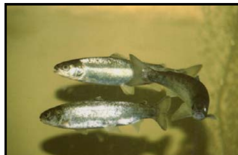
Figure 1. Atlantic Salmon Smolt. These salmon are one of the species Fish and Wildlife Service has targeted for recovery.

Science projects are conducted both internally by employees and externally by contractors. Interior science projects include, but are not limited to, oil spills, geologic hazards, acid mine drainage, Everglades restoration, geologic studies, desalination, climate change and biological research.